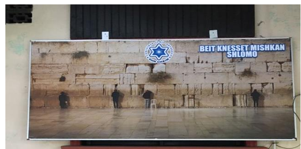
Figure 2. Sign for Beit Knesset Mishkan Shlomo.

In present time, religious considerations influence discussions about reproductive rights, equal marriage, inclusive education, and LGBTQ+ rights (García, 2022; Naciones Unidas Honduras, 2023). Although the state and the church are separated, the moral foundations of the Honduran state are Christian (Ferrari, 2014). In this context, the Jewish communities of Honduras experience a religious hegemony that still favors assimilation over a visible coexistence of alternative beliefs and lifestyles.