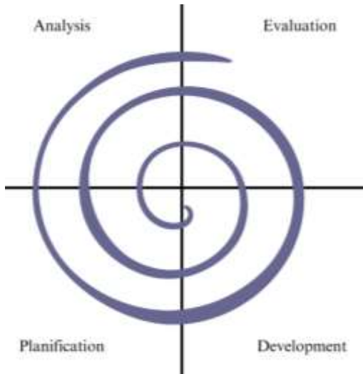
Figure 2. Barry Boehm's spiral methodology diagram.